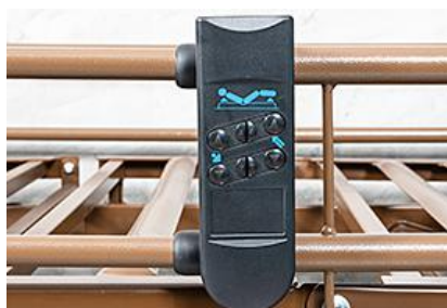
Remote hand control

Height of the bed can be adjusted by manual crank on bed end.