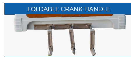
FOLDABLE CRANK HANDLE