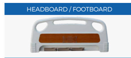
HEADBOARD / FOOTBOARD