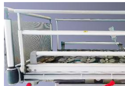
Telescopic side rail

Height, back and foot section can be adjusted by remote controller, auto-counter to provide the patient from sliding into foot end.