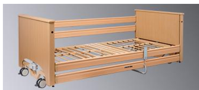
EXTRA LOW HEIGHT

The special U-shaped frame is closer to the ground, so that the minimum height of the home care bed is 300mm.