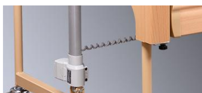
PRECISION LIFTING COLUMN

There are stoppers under the headboard and footboard, which can prevent the side rail from sliding down and prevent safety accidents.