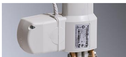
GERMANY DEWERT CONTROL SYSTEM

Total 4pcs linear heavy duty type actuator will guarantee different position adjustment and safety loading 180kg.