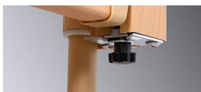
SIDE RAILING STOPPER

The full-length side rail prevents the patient from falling down, and the height of the guardrail can be adjusted by pressing button.