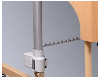
PRECISION LIFTING COLUMN

There are stoppers under the headboard and footboard, which can prevent the side rail from sliding down and prevent safety accidents.