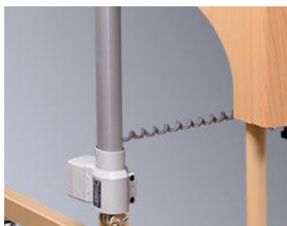
PRECISION LIFTING COLUMN

There are stoppers under the headboard and footboard, which can prevent the side rail from sliding down and prevent safety accidents.