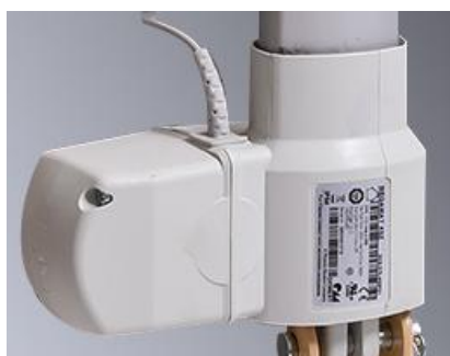
GERMANY DEWERT CONTROL SYSTEM

Total 4pcs linear heavy duty type actuator will guarantee different position adjustment and safety loading 180kg.