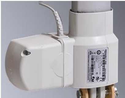
GERMANY DEWERT CONTROL SYSTEM

Total 4pcs linear heavy duty type actuator will guarantee different position adjustment and safety loading 180kg.