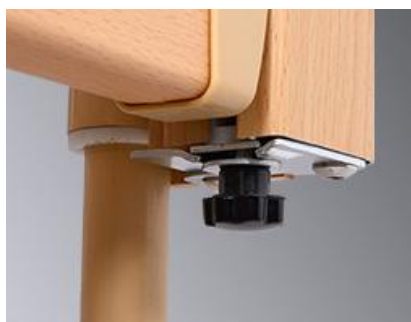
SIDE RAILING STOPPER

The full-length side rail prevents the patient from falling down, and the height of the guardrail can be adjusted by pressing button.