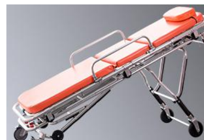
REVERSE TRENDELEBURG POSITION

By pulling the handle of the head, the head can be brought down quickly, reaching trendelenburg position.