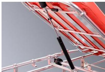
Foot section adjust

The foot section is adjusted by the gas spring . It can be adjusted according to the condition of the injured person.