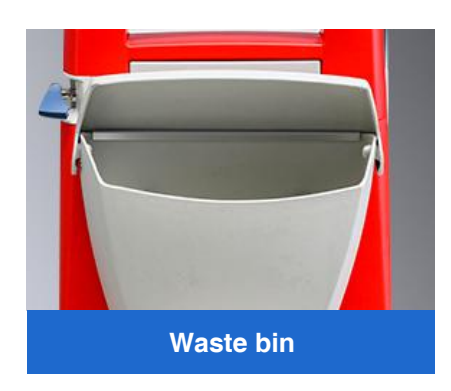
Standard with flip-top waste bin, optional foot pedal waste bin.