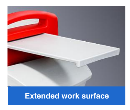
The pull-out extension surface is convenient for medical staff to write on it.