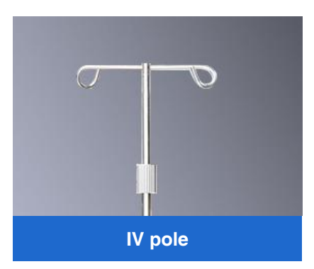
2 hooks, height adjustable.