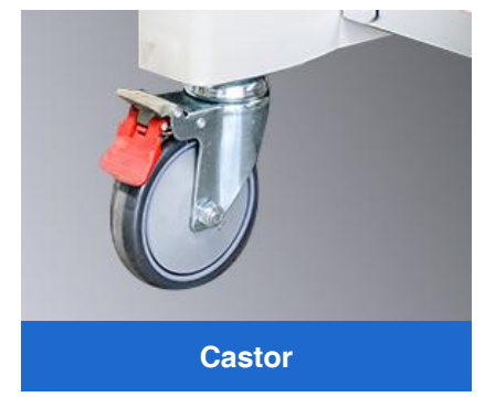
Luxury silent 5 inch casters, 2 with brake.