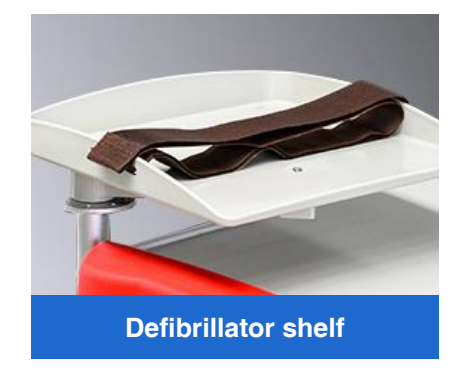
The shelf can hold emergency equipment such as a defibrillator.