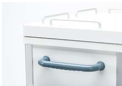
Storage space and push handle

There are four 100mm diameter luxury castors on the bottom and two of them with a brake.