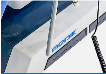
Built-in foot pedal

Featuring a built-in foot pedal which empowers operators by freeing their hands, thereby minimizing hygiene concerns.