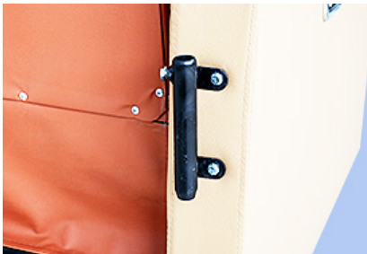
IV pole holder

The cup is embedded in the left side of the armrest of the chair, where you can place a water cup.