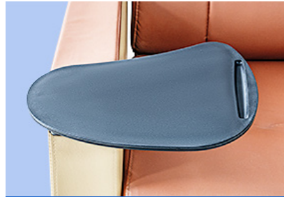
Small dining table

The adjustment of the back and legs can be adjusted by manual handle.