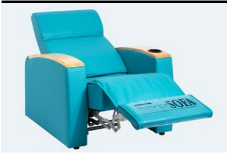
Leg and back section is adjusted by mechanism adjustment switch