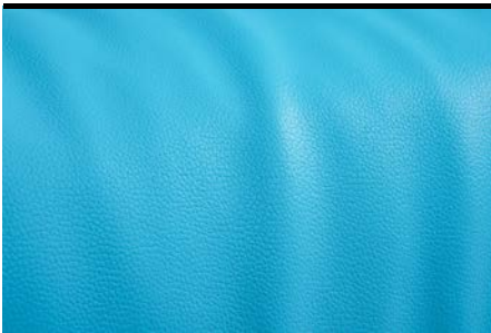
Thick foam upholstery for comfort