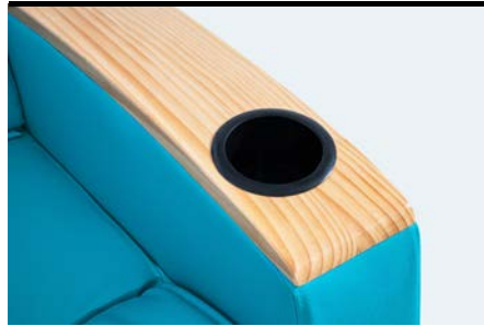
Mechanism adjustment switch