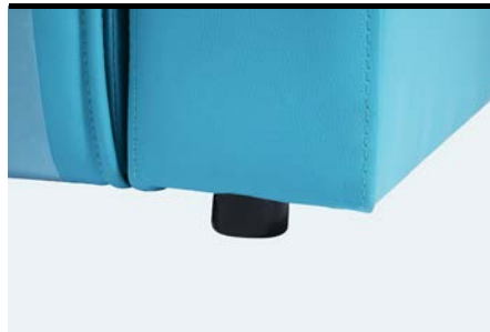
Bottom can be castor or plastic feet