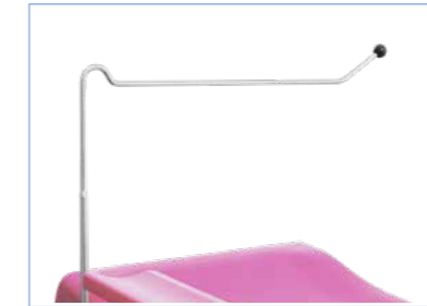
ANESTHESIA SCREEN FRAME