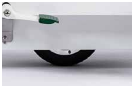
Center Swivel Wheel